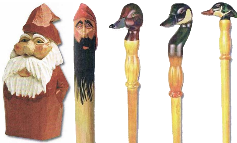
SANTA CLAUS FIGURE