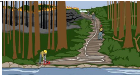
Post lookouts when there is possible danger