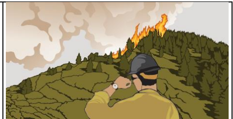
Base all actions on current and expected behavior of the fire