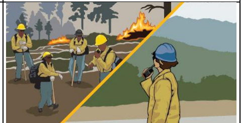
Be alert. Keep calm. Think clearly. Act decisively