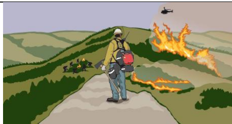
Know what your fire is doing at all times