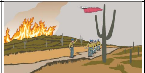
Maintain control of your forces at all times