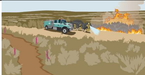
Fight fire aggressively, having provided for safety first