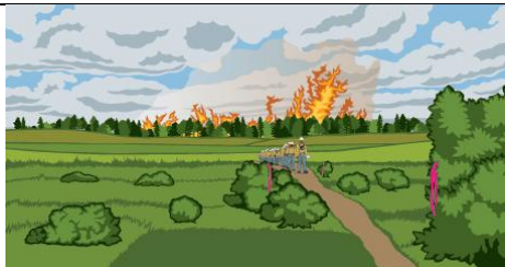
Identify escape routes and safety zones, and make them known