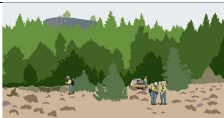
Maintain prompt communications with your forces, your supervisor, and adjoining forces