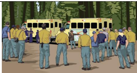
Give clear instructions and be sure they are understood